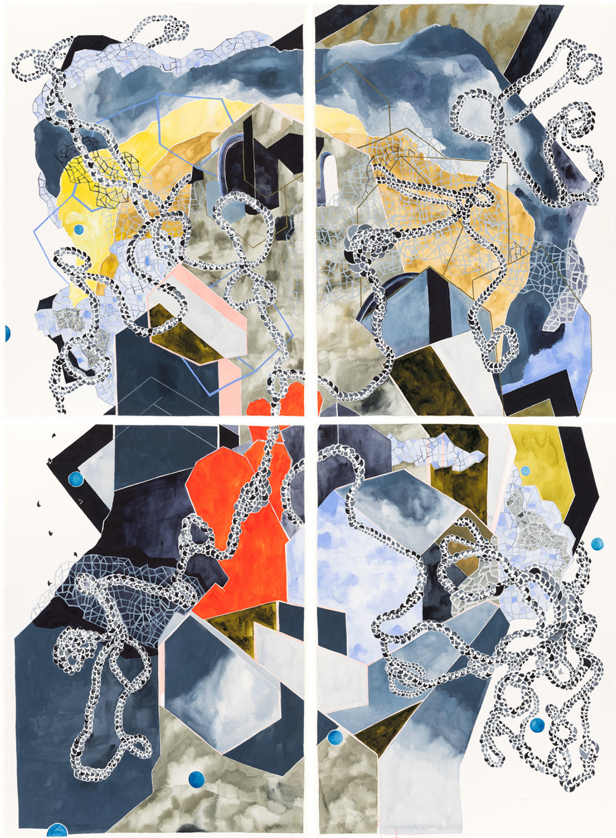
Keren Kroul, An Architecture of Longing , 2021, watercolor on paper, 60" x48". Photo courtesy of Rik Sferra